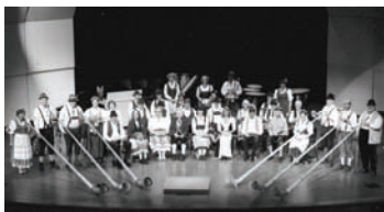
EIN PROSIT GERMAN BAND