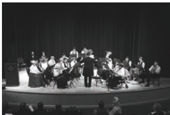
YPSILANTI TOWN BAND