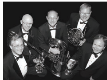
BARONS OF BRASS