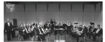
OAKLAND BRASS BAND