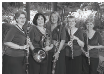
CLASSIC WINDS WOODWIND QUINTET