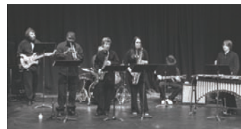
MUSKEGON COMMUNITY COLLEGE JAZZ ENSEMBLE