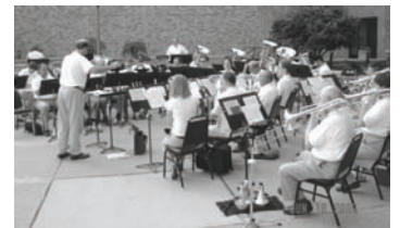
CAPITAL CITY BRASS BAND